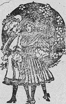
10c. A COPY, $1.00 A YEAR.

THE FASHION AND PATTERN MAGAZINE FOR YOUNG FOLKS.