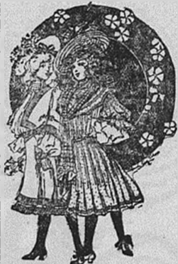
50c. A COPY, $1.00 A YEAR.

Junior Toilettes THE FASHION AND PATTERN MAGAZINE FOR YOUNG FOLKS.