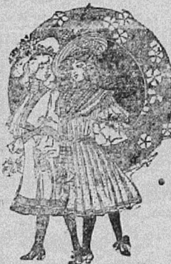
10c. A COPY, $1.00 A YEAR.

Junior Toilettes THE FASHION AND PATTERN MAGAZINE FOR YOUNG FOLKS.